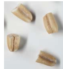
Oats, coarsely cut