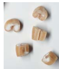
Wheat, finely cut