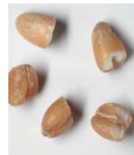
Wheat, coarsely cut