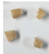
Oats, finely cut